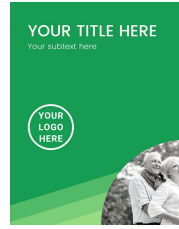
7.5"W x 9.5"L