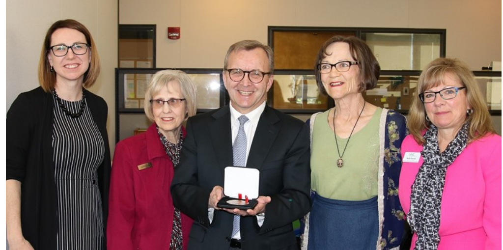
HONOURING OUR VOLUNTEERS

"On behalf of the Senate of Canada, the Senate Sesquicentennial Medal is hereby conferred upon you in commemoration of the one hundred and fiftieth anniversary of the Senate of Canada and in recognition of your valuable service to the nation."