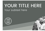
3" W X 2" L