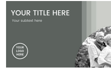
9.5" W X 4.75" L