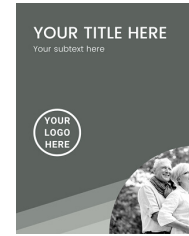
7.5" W X 9.5" L