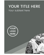
4.75" W X 3.75" L