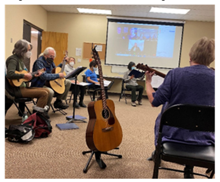
Participants join in from home with the Sing! group at Sage thanks to new technology and a willingness to figure it out.

Instructors and participants of Sage's Life Enrichment programs are working together to use new live streaming technology to create spaces that include both participants on-site at Sage and others who connect through Zoom.